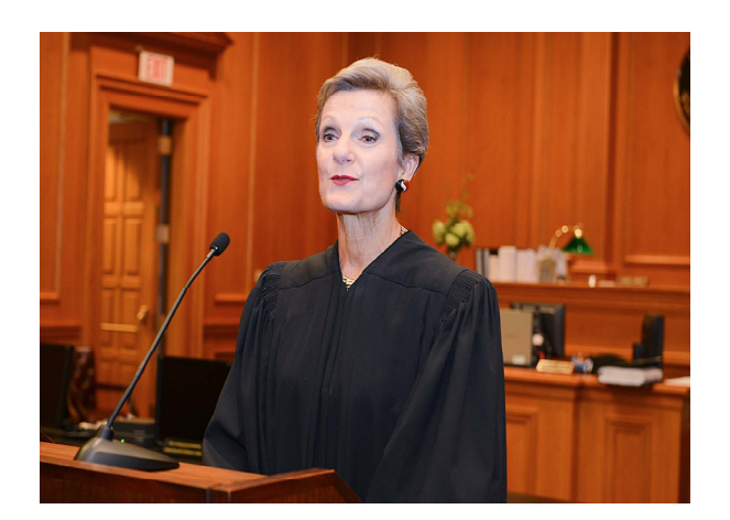
Judge Loretta A. Preska.